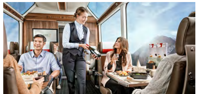
1 st Class