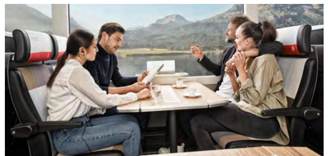
2 nd Class