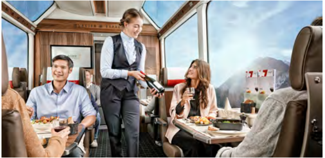
1 st Class