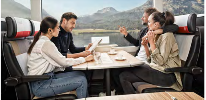
2 nd Class